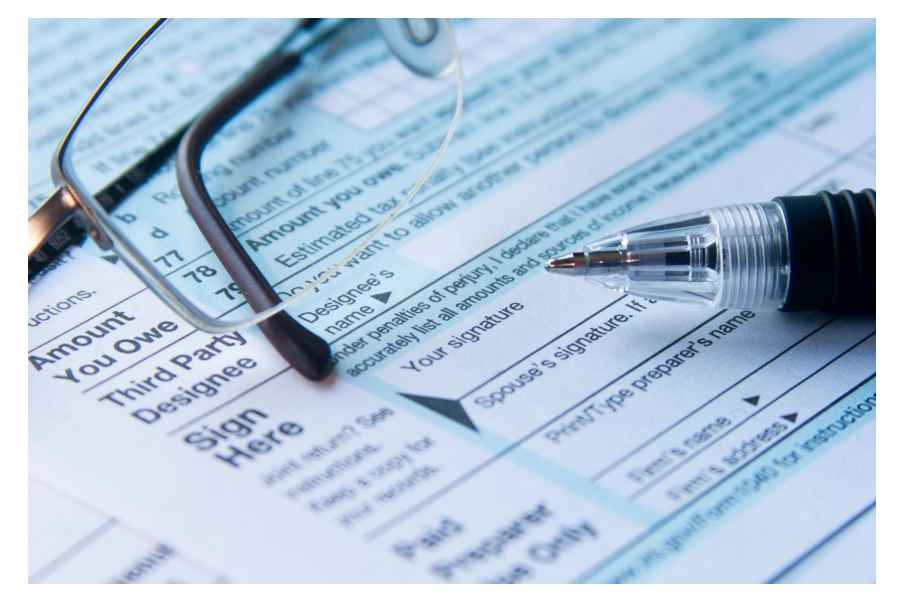
This Photo by Unknown Author is licensed under <u>CC BY-ND</u>